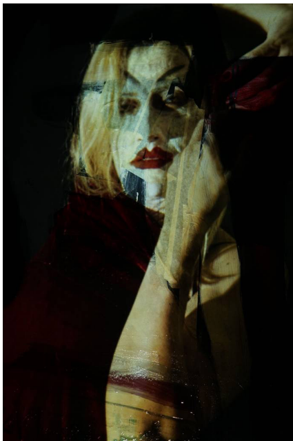
Mephisto Feminin , 2018 Digital Photo Painting on AluDibond 39" x 29"

Agora Gallery | 530 West 25th Street, New York, NY, 10001