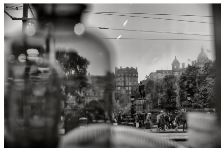
12_Through the Bottle Photograph on Fine Art Paper 12" x 18"