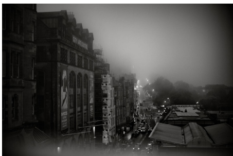
05_Tender of the Night Fog Photograph on Fine Art Paper 12" x 18"