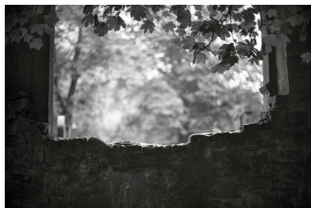
06_Out of the Stone Wall Photograph on Fine Art Paper 12" x 18"